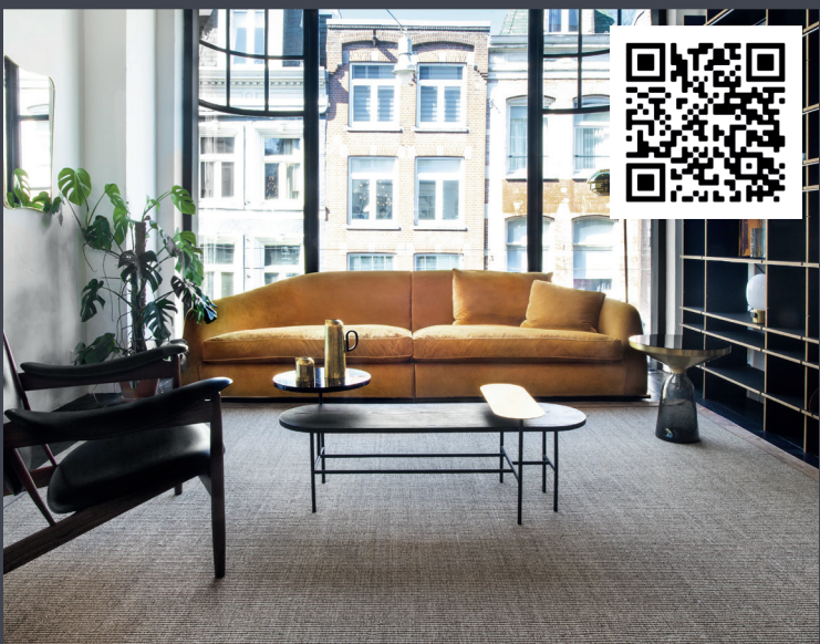
Scan QR-code to request 9422 A5-samples