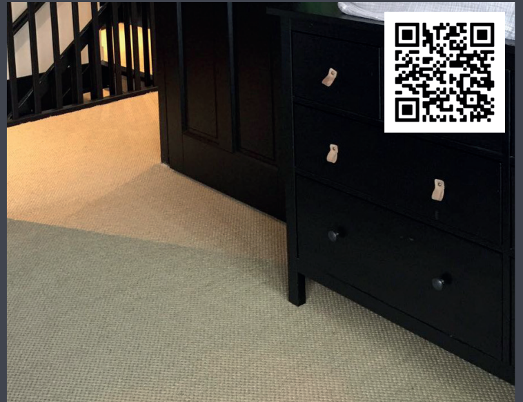
Scan QR-code to request 9423 A5-samples