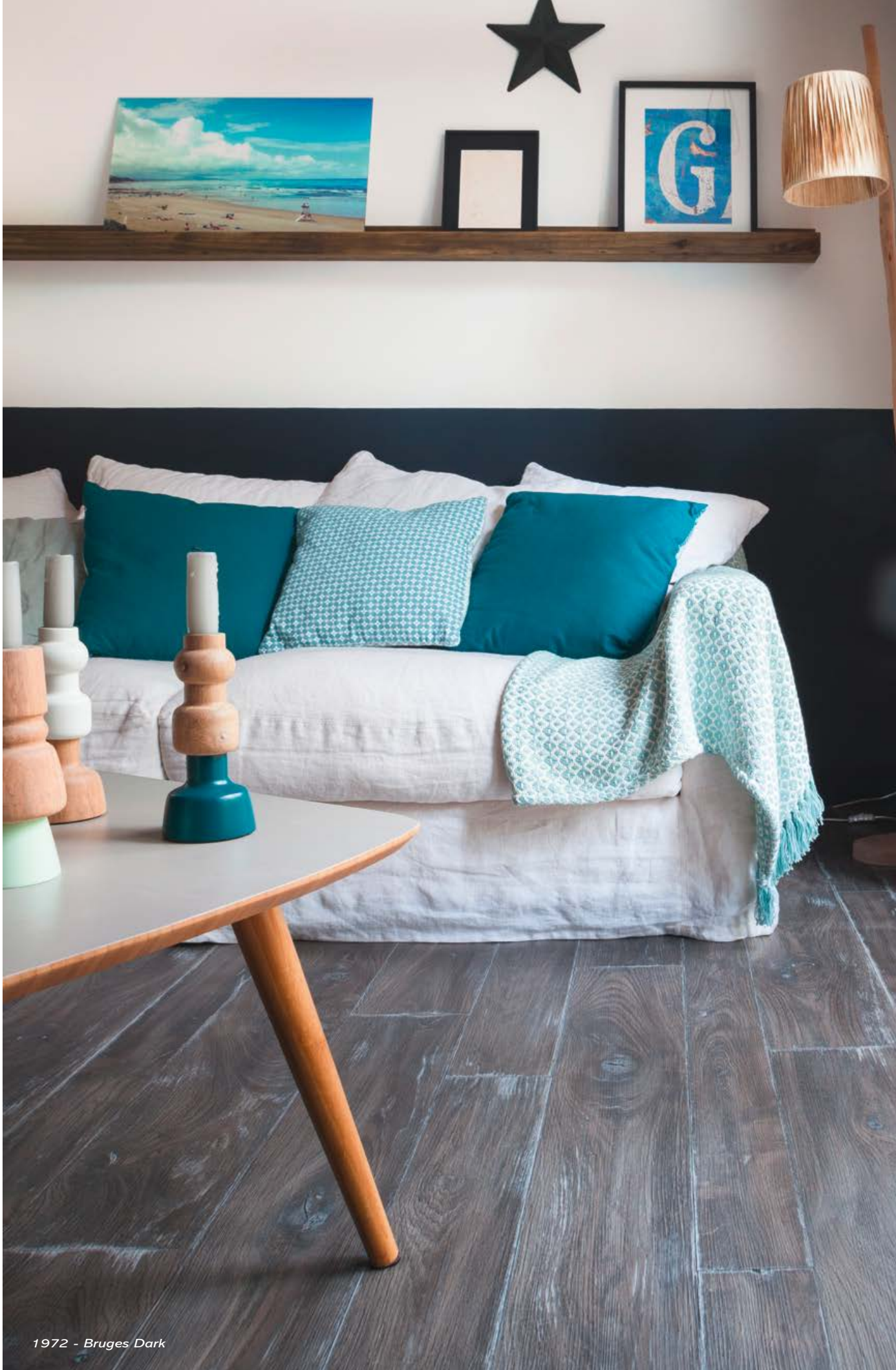
1972 - Bruges Dark