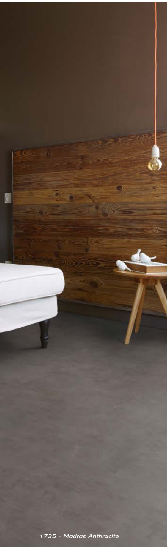
1735 - Madras Anthracite