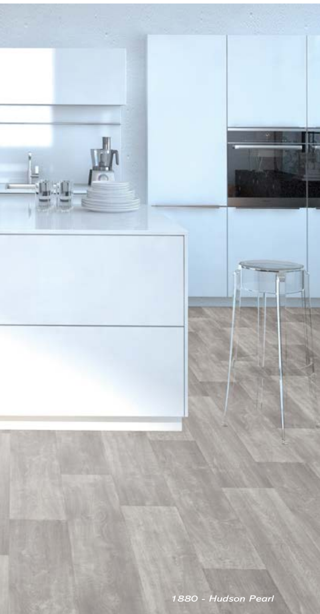
1880 - Hudson Pearl