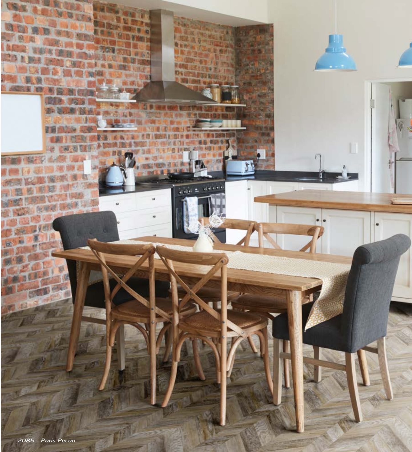
2085 - Paris Pecan