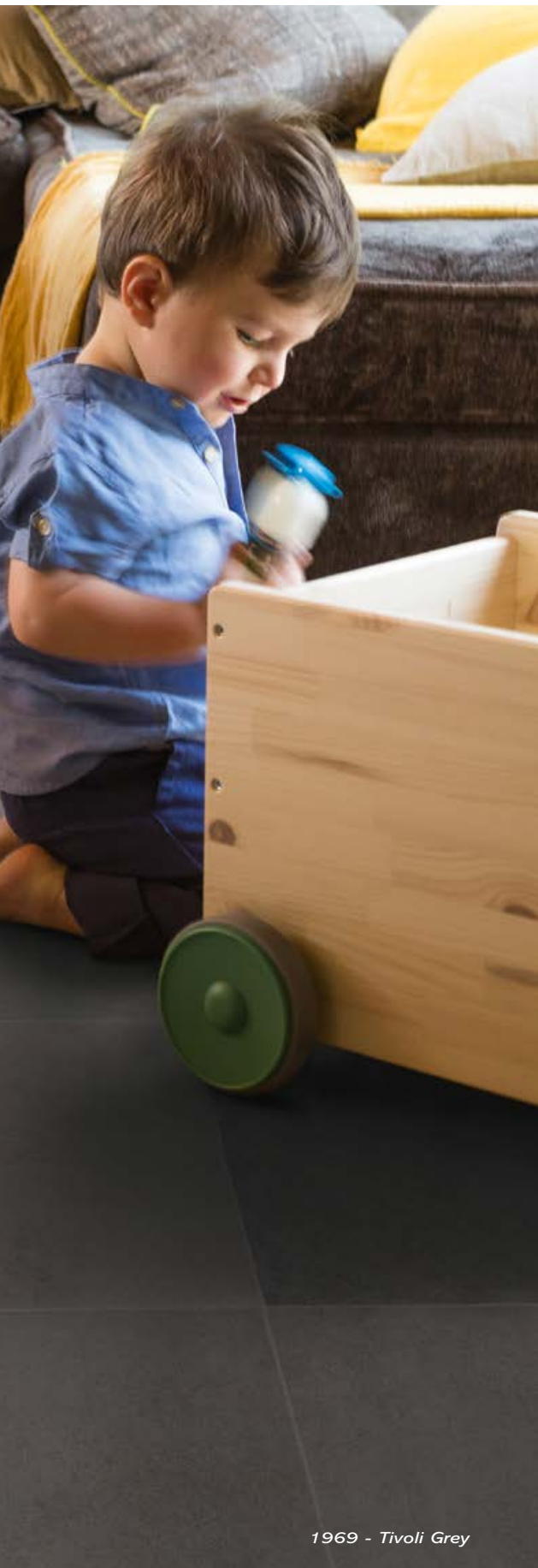
1969 - Tivoli Grey