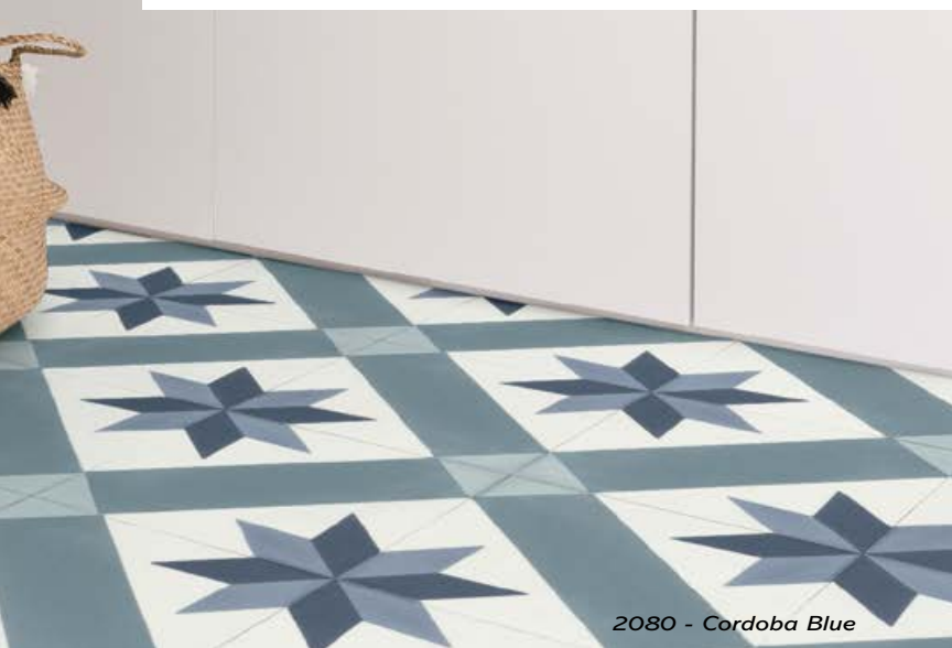
2080 - Cordoba Blue