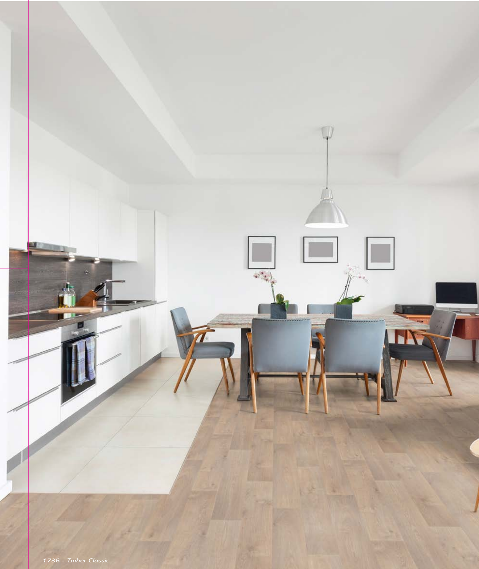
1736 - Timber Classic