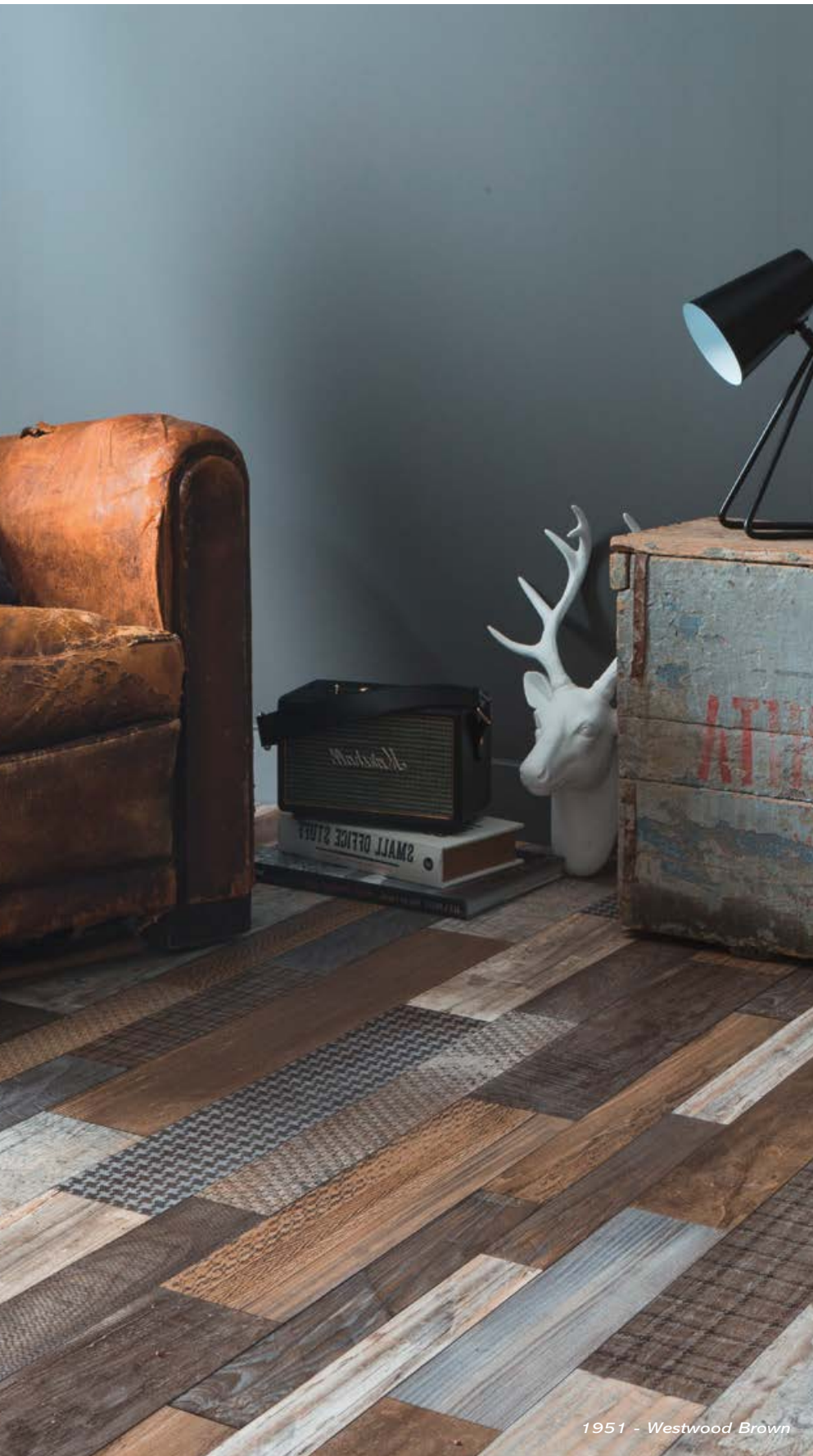
1951 - Westwood Brown