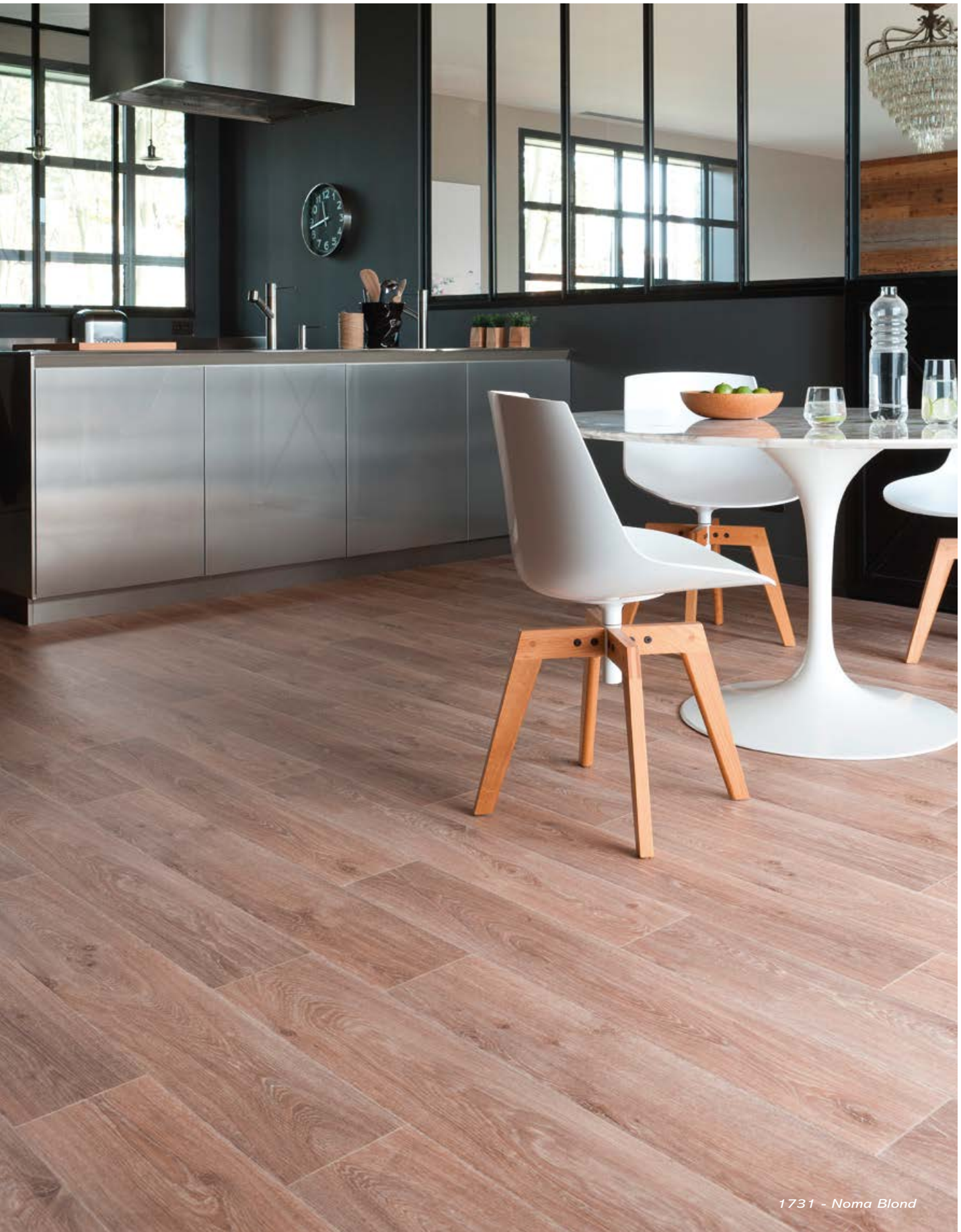
1731 - Noma Blond