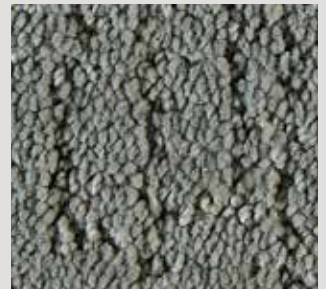
▶ SB: LUU2.0840 | 400 cm