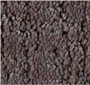
▶ SB: LUU2.0080 | 400 cm