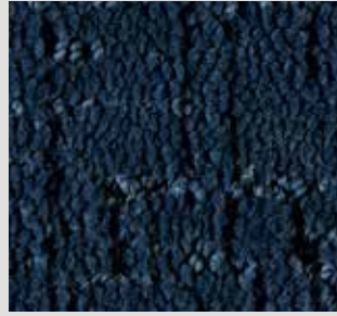
▶ SB: LUU2.0780 | 400 cm