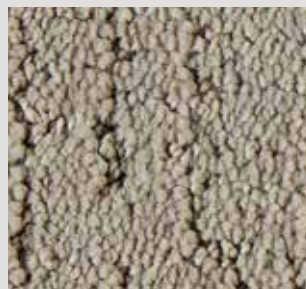
▶ SB: LUU2.0260 | 400 cm