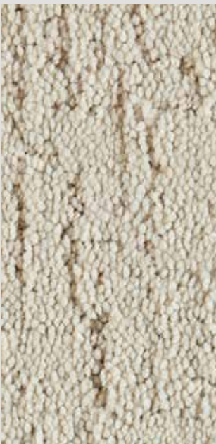
▶ SB: LUU2.0440 | 400 cm