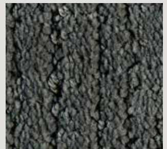
▶ SB: LUU2.0810 | 400 cm