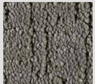
▶ SB: LUU2.0410 | 400 cm