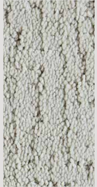
▶ SB: LUU2.0880 | 400 cm