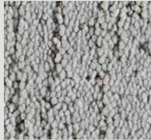
▶ SB: LUU2.0870 | 400 cm