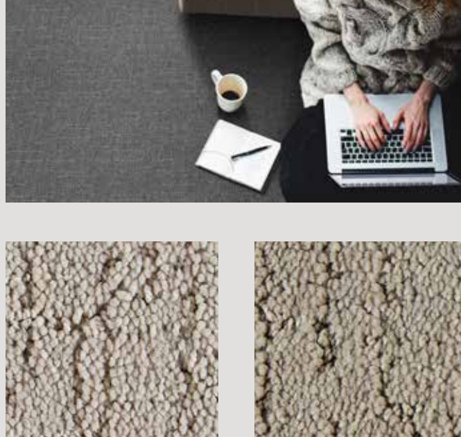
▶ SB: LUU2.0430 | 400 cm