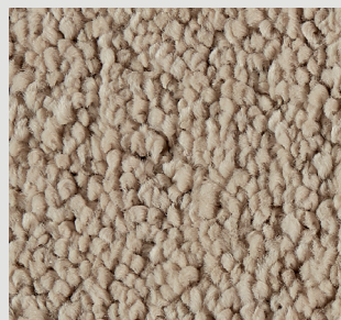
▲ SB: LUYO.0450 | 400 & 500 cm