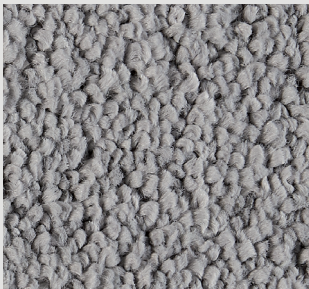
▲ SB: LUYO.0870 | 400 & 500 cm