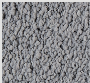
▲ SB: LUYO.0850 | 400 & 500 cm