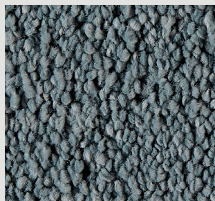
▲ SB: LUYO.0740 | 400 & 500 cm