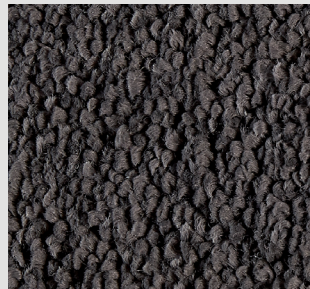
▲ SB: LUYO.0820 | 400 & 500 cm