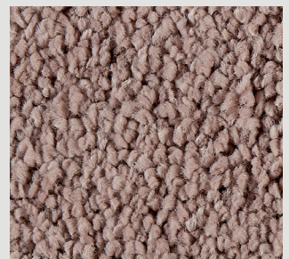
▲ SB: LUYO.0170 | 400 & 500 cm