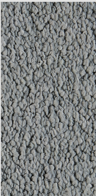
▲ SB: LUYO.0860 | 400 & 500 cm