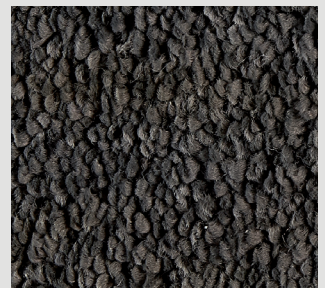
▲ SB: LUYO.0810 | 400 & 500 cm