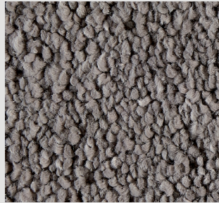
▲ SB: LUYO.0420 | 400 & 500 cm