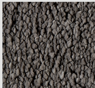
▲ SB: LUYO.0410 | 400 & 500 cm