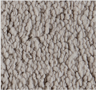
▲ SB: LUYO.0440 | 400 & 500 cm