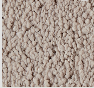
▲ SB: LUYO.0240 | 400 & 500 cm