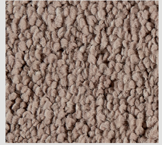
▲ SB: LUYO.0260 | 400 & 500 cm