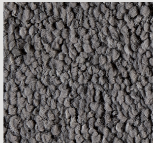
▲ SB: LUYO.0840 | 400 & 500 cm