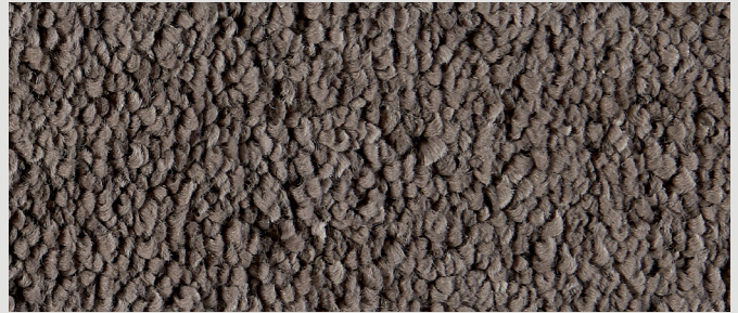
▲ SB: LUYO.0270 | 400 & 500 cm