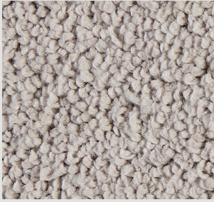
▲ SB: LUYO.0430 | 400 & 500 cm