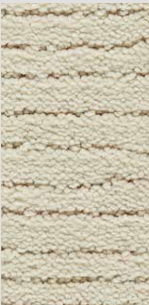
▶ SB: LUU1.0440 | 400 cm