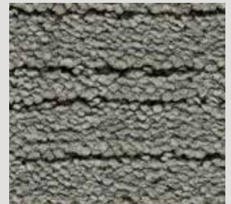
▶ SB: LUU1.0840 | 400 cm