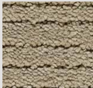
▶ SB: LUU1.0260 | 400 cm