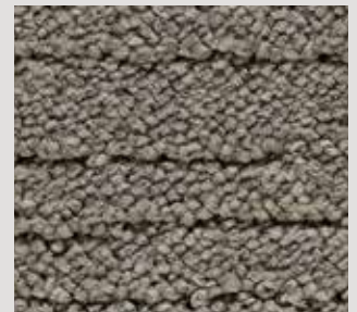
▶ SB: LUU1.0410 | 400 cm