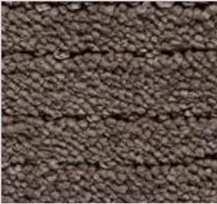
▶ SB: LUU1.0080 | 400 cm