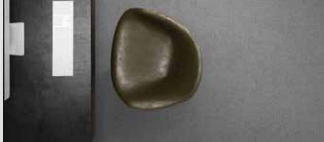
▶ SB: LUU1.0810 | 400 cm