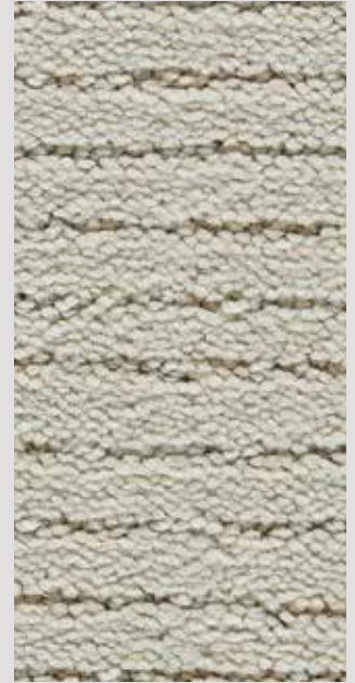
▶ SB: LUU1.0880 | 400 cm