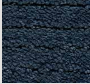
▶ SB: LUU1.0780 | 400 cm