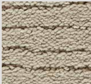
▶ SB: LUU1.0430 | 400 cm