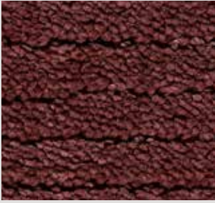
▶ SB: LUU1.0180 | 400 cm