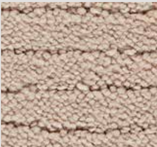
▶ SB: LUU1.0170 | 400 cm