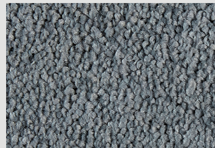
▲ SB: LYHO.0850 | 400 & 500 cm