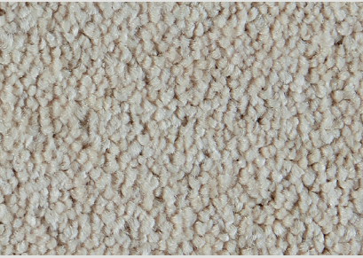
▲ SB: LYHO.0221 | 400 & 500 cm