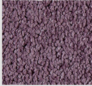
▲ SB: LYHO.0062 | 400 & 500 cm