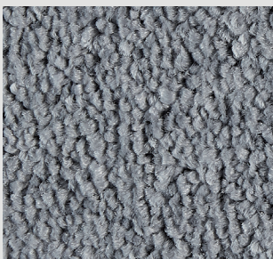
▲ SB: LYHO.0841 | 400 & 500 cm