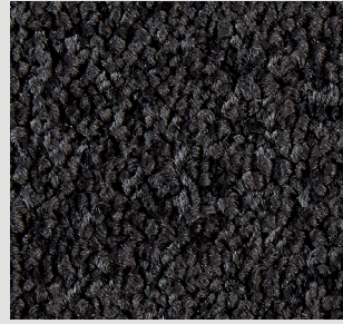
▲ SB: LYHO.0081 | 400 & 500 cm