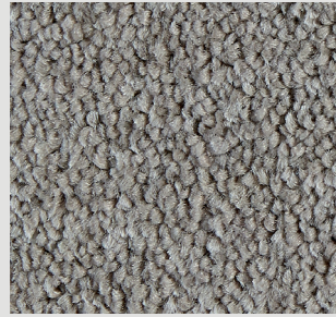
▲ SB: LYHO.0460 | 400 & 500 cm