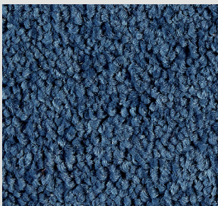
▲ SB: LYHO.0782 | 400 & 500 cm