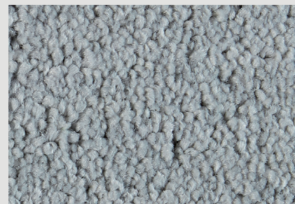
▲ SB: LYHO.0871 | 400 & 500 cm