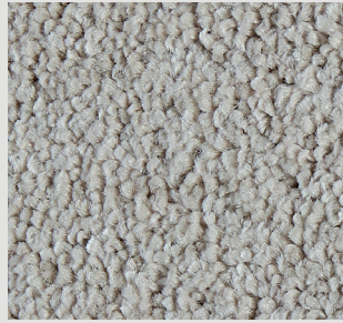
▲ SB: LYHO.0451 | 400 & 500 cm