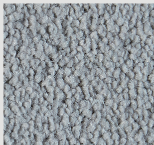
▲ SB: LYHO.0880 | 400 & 500 cm