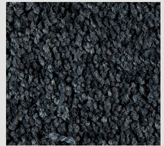
▲ SB: LYHO.0830 | 400 & 500 cm