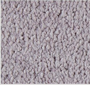
▲ SB: LYHO.0052 | 400 & 500 cm