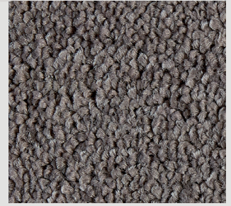
▲ SB: LYHO.0091 | 400 & 500 cm