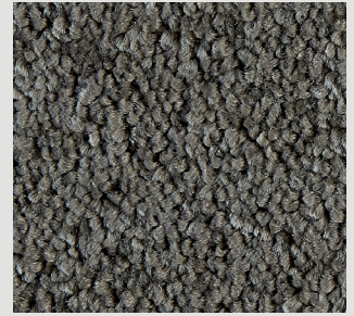
▲ SB: LYHO.0470 | 400 & 500 cm